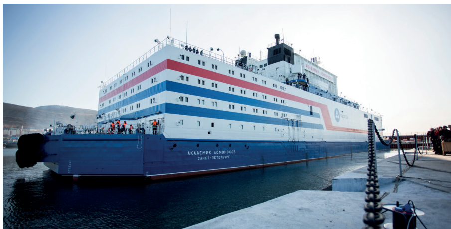
The Akademik Lomonosov, the world's first floating nuclear power plant

Small-scale nuclear reactors have actually been operating for many years, with over 27 small and medium power reactors operating globally. SMRs are also powering icebreakers and aircraft carriers. Earlier this year, the world's first floating nuclear power plant (and SMR), the Akademik Lomonosov , started operation, providing combined heat and power to remote communities in the Russian Arctic.